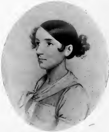
Matilda Hoffman By Edward Greene Malbone Page 156